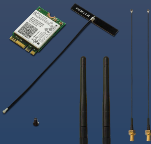
M.2 2230 WiFi kit Intel® Wireless-AC 9260 (802.11ac, Bluetooth 5.0)

Expand your UP Squared Pro board to fit your exact needs