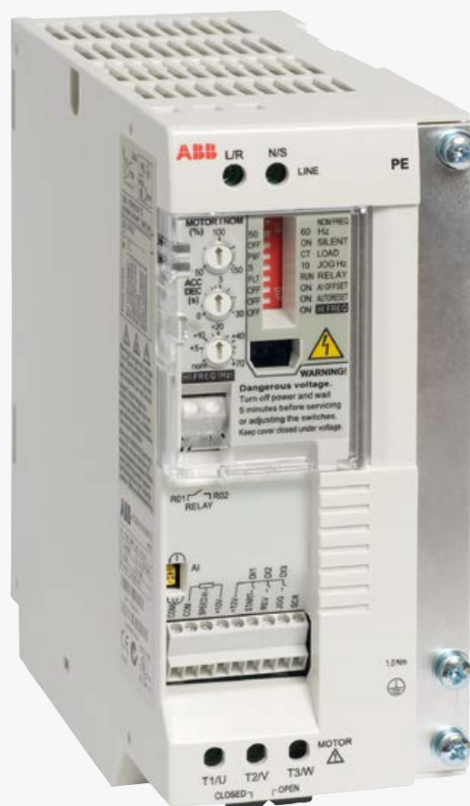
ABB micro drives ACS55, 0.18 to 2.2 kW