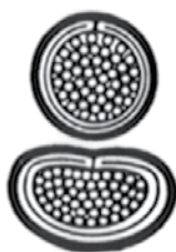
Strands enter as a homogeneous group and compact tightly under compression due to fully brazen seam

Because of the mechanical strength of copper, an installer can experience fatigue associated with repeated installations. For this reason, Thomas & Betts puts its terminals through one more step called selective annealing. This process leaves the barrel soft enough to crimp and form around the wire. However, we "cold form" the tongue during the manufacturing process so it remains strong. This is done so the tongue can withstand repeated bends and bolt tightening strain common in most electrical installations. Many competitors attempt to accomplish similar goals by removing valuable material or using a softer copper, which has lower conductivity. This increases electrical resistance as well as the odds for shorting and downtime.