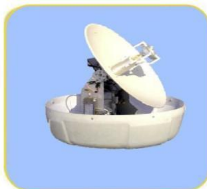
Precision Farming Antenna Stabilization

The ACEINNA IMU380ZA integrates highly-reliable MEMS 6DOF inertial sensors (optional 3-axis magnetic sensors) in a miniature factory-calibrated module to provide consistent performance through the extreme operating environments in a wide variety of dynamic control and navigation applications.