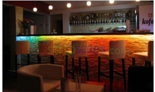
Living rooms, coffee / wine bars, back lighting

TV, dancefloor background, shopping malls,