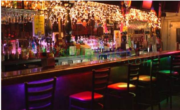
Hotels ,restaurants, nights clubs, edge light