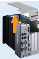
2. Withdraw the thumbscrew and remove the top cover