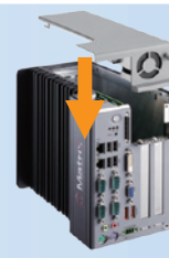
3. Replace it by plugging the hot-pluggable fan module cover into the fan connector on CPU board