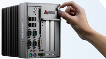
1. Undo the thumbscrew by hand