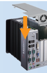
3. Replace it by plugging the hot-pluggable fan module cover into the fan connector on CPU board