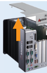
2. Withdraw the thumbscrew and remove the top cover