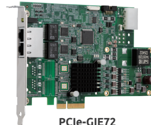
PCIe-GIE72 PCIe-GIE72 PRO

Integrated software License Management and advanced FPGA-based Trigger over Ethernet synchronizing multi-camera acquisitions significantly reduce ownership costs.