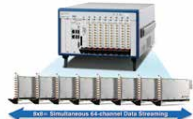
Equipped with ADLINK PXES-2590 PXIe chassis and PXle-9848 modules, high density testing system with up to 64 channels can be implemented. Note: For PXES-2590 details, please refer to pages 1-13.

The PXle-9848H's signal conditioning module provides 8 simultaneous analog inputs and 15:1 or 50:1 attenuation ratio, implemented with solid product design and strict verification testing to ensure maximum performance, thereby enabling the high dynamic performance of 63.5 dB SFDR and 55.5 dB SINAD while supporting high input voltage range of \pm 100 V.