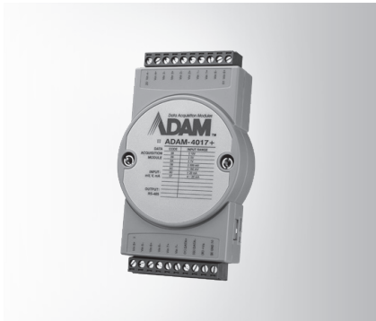
ADAM-4017+ CE FCC RoHS

8-ch Analog Input Module with Modbus 8-ch Thermocouple Input Module with Modbus 8-ch Universal Analog Input Module with Modbus