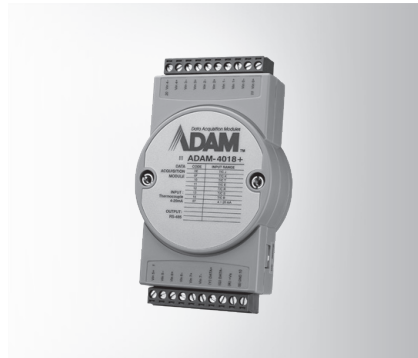
ADAM-4018+ CE FCC RoHS