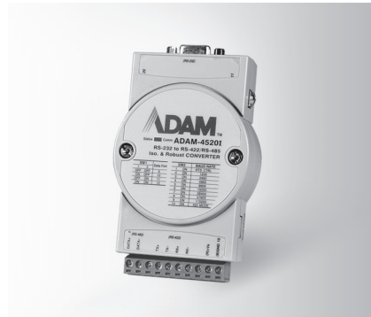
ADAM-4520I FCC CE RoHS UL US