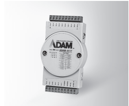
ADAM-4117 FCC CE RoHS UL US