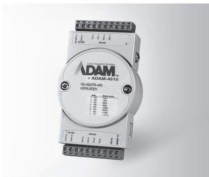
ADAM-4510/4510S FCC CE RoHS COMPLIANT 2002/95/EC

Addressable RS-422/485 to RS-232 Converter