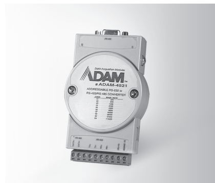
ADAM-4521 UL US LISTED ENEC RoHS COMPLIANT 2002/95/EC