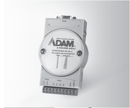
ADAM-4521 UL US LISTED ENEC RoHS COMPLIANT 2002/95/EC