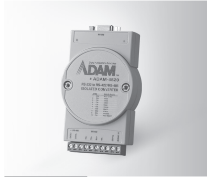
ADAM-4520 FCC CE RoHS COMPLIANT 2002/95/EC