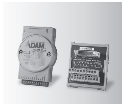
ADAM-6018 FCC CE RoHS UL LISTED E129381 ETC.