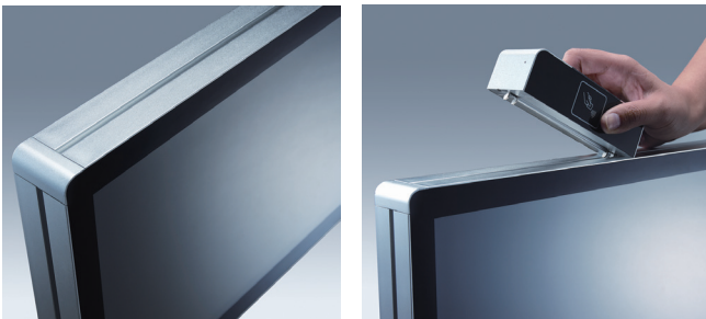
Side groove design for Flexible peripheral device