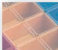
Organised Secure assorting due to the locking knobs in the lid

Variable and versatile assortment boxes with “pizzazz”: Cleverly dimensioned insert bins with three extra compartments offer plenty of space for items such as folding rulers and screwdrivers. The removable scale insert can be used as a measuring tool (cm/inch).