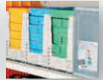
P.O.S.-optimised EuroPlus Flex 37/1 and insert bins ›EuroPlus Insert‹