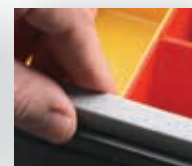
Useful Scale insert with cm/ inch