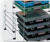
Clever Wire-rack system holding 4x EuroPlus Flex 37 (see p. 72)

EuroPlus Flex assortment boxes provide reliable organisation and clear view of items such as office supplies, sewing supplies, electrical sleeves, hardware, fittings etc.