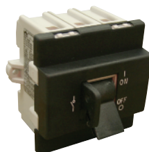
Special Black Toggle Handle Motor Disconnect Switch EVA3100 + K/EVAB