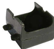
Rubber Boot for Contact Elements Cat. No. 2SEBT2