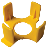
E-Stop Shroud Plastic protector: Cat. No. 2ESS1 Plastic protector (UL): Cat. No. 2ESS1-UL