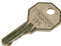
Replacement Keys For all 22mm operators wth keys Cat. No. 2KY455