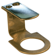
Padlock For mushroom actuator: Cat. No. 2PAM For projecting actuator: Cat. No. 2PAP