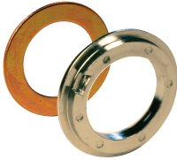
Adapter for installing a Ø22.5 device in Ø 30.5 cutout Cat. No. 2ADP (with washer) ADW (washer only)