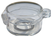
Plastic Cover Cat. No. 2PAM7