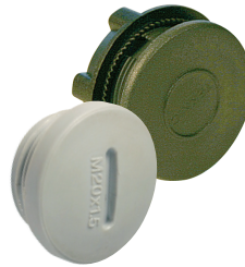
Blanking plug for 22.5 mm holes Color: Black Cat. No. 2BP2 Blanking plug for M20 (20mm) or NPT 1/2" holes Color: Gray Cat. No. M20 Cat. No. NPT1/2