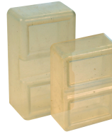
Rubber Boot for Twin Actuators Color: Clear Cat. No. 2ATBT7 (Non-Illuminated) 2ATLBT7 (illuminated)