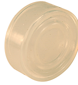
Transparent Silicone Rubber Boot for Flush Actuators Color: Clear Cat. No. 2BT7 (for non-illuminated) 2ALBT7 (for illuminated)