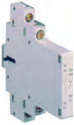
Auxiliary contact blocks for side mounting (3.5A/230V AC; 2A/400V AC)

MS Three Phase Adjustable Trip Economy Manual Motor Controllers