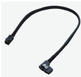
Internal Mini-SAS HD to mini-SAS Right Angle end Cables