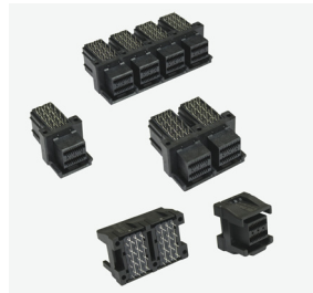
Internal Mini-SAS HD Connectors