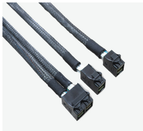
Internal Mini-SAS HD Cables