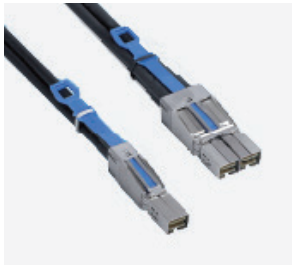
External Mini-SAS HD Cables