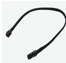
Internal Mini-SAS HD to mini-SAS Straight End Cables