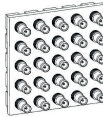
1.0/2.3 DIN 10mm pitch 250% Density