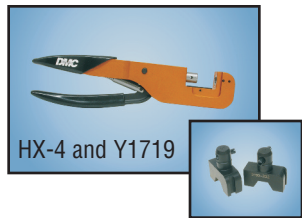
HX-4 and Y1719