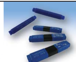
Single In-Line Splices Dual In-Line Splices Electronic Splices