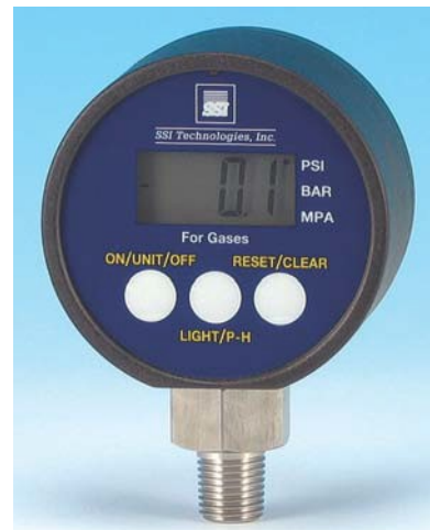
MediaGauge™ Model MG-9V and Model MG-9V-F

The MediaGauge™ MG-9V digital pressure gauge has better accuracy, longer life and standard multiple functions which make it a better choice than mechanical pressure gauges.