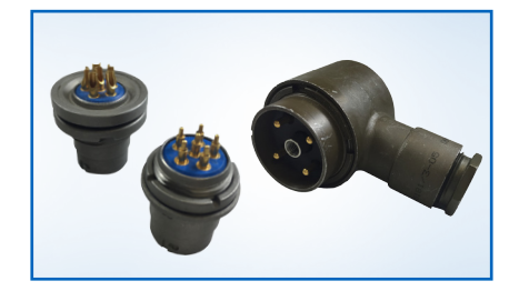
Military Audio /Power