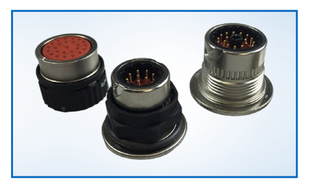
Pegasus Series NEW