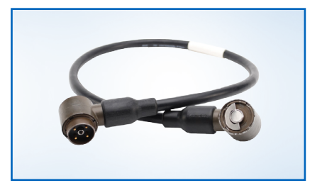
Cable Solutions & Cable Adapters NEW