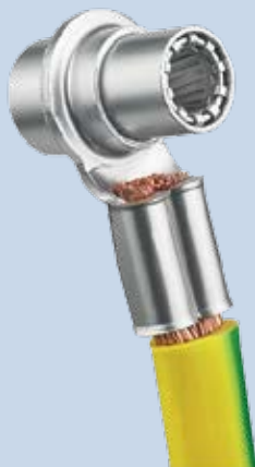
N02 060 6 164 002 - Radsok contact 10 - 16mm 2