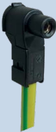
C360 G01 141 E2 - Housing for 6mm Radsok, 10 - 16mm 2