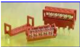
TMM-2 IDC Paddle board.