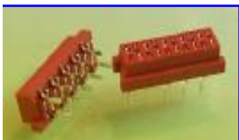
TMM-4 DIP Female .