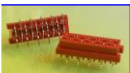
TMM-6 SMT Female straight.