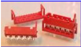
TMM-1 IDC Male.

Amphenol's commercial products are used in a variety of end user applications including networking, telecom, server & computer, storage & HDD, consumer electronics and entertainment, professional audio & Industrial.