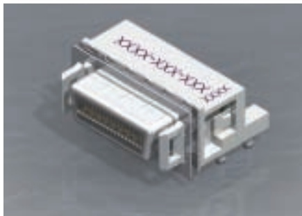
Lanyard latch with rear arms and solder posts U65-B04-40C0-T