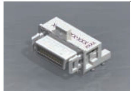
Lanyard latch with top mounting, rear arms U65-H04-40D0-T