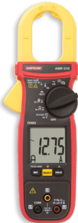
AMP-310 AC Clamp Meter HVAC