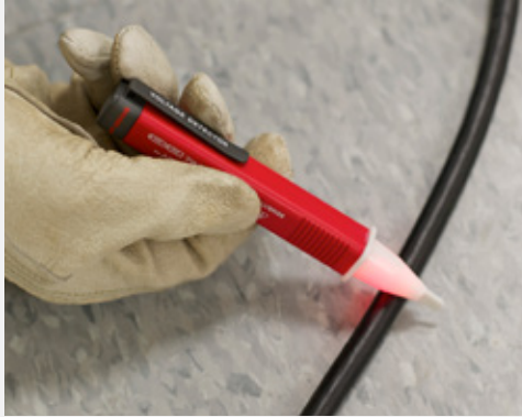
VP-1000 Non-Contact Voltage Detector