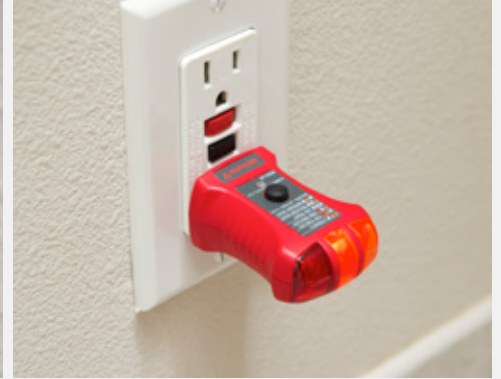
ST-102B Socket Tester with GFCI

Double insulated, CAT IV 1000V safety rating