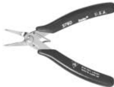
Static-dissipative pliers — black grips (Suffix "D")