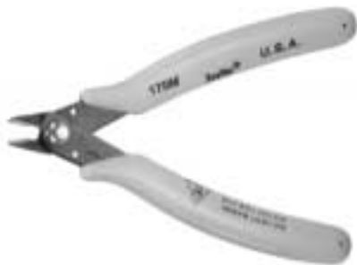
Shearcutter — Light blue grips (Suffix "M")