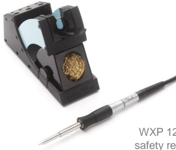
WXP 120 set with safety rest WDH 10