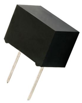
Actual Size (Max.)