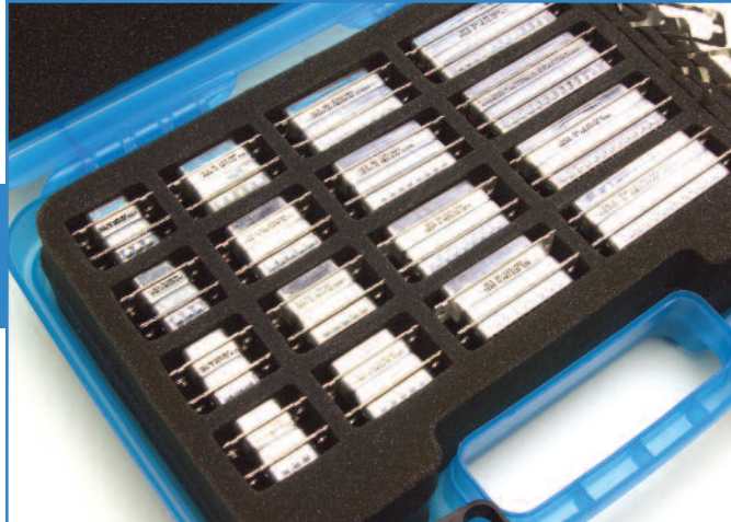
Adapter Test Kit