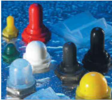
Matching Colors Available