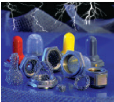
EMI/RFI Suppression Versions