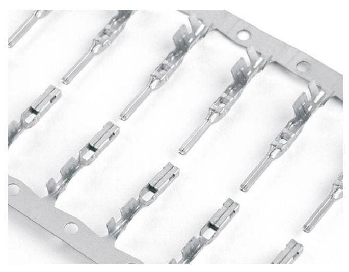
APEX® 1.5 Female & Male Terminals