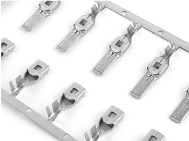
APEX ® 6.35 Female & Male Terminals