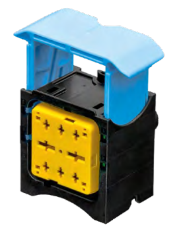
SICMA Sealed Relay Socket 8W Female