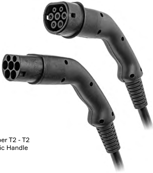
Jumper T2 - T2 Plastic Handle