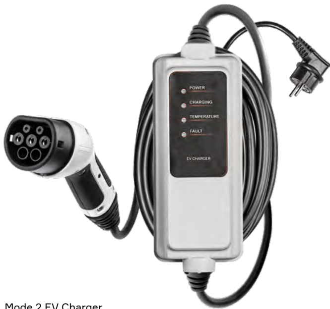
Mode 2 EV Charger