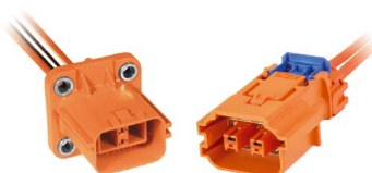
2 Way 180° Connection System without Pluggable Inner Connector