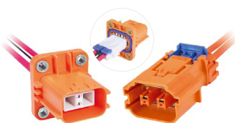
2 Way 180° Connection System with Pluggable Inner Connector