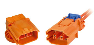
2 Way 90° Connection System