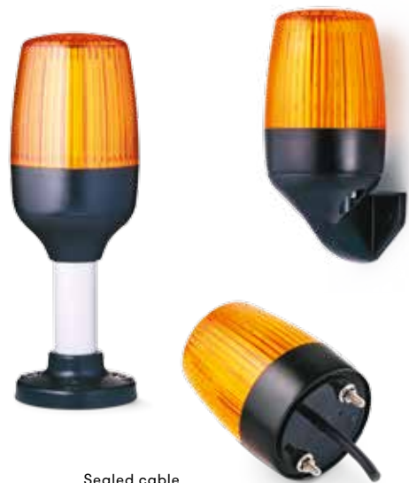
Sealed cable insulation/entry