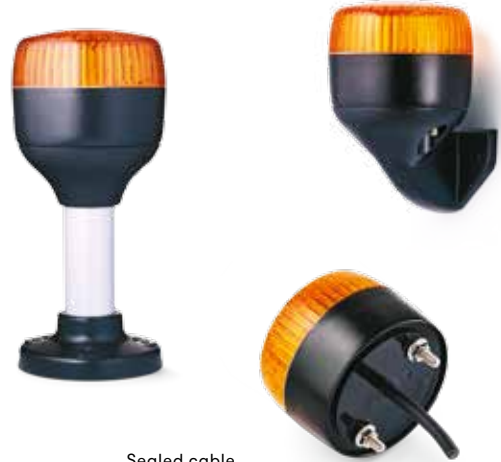
Sealed cable insulation/entry