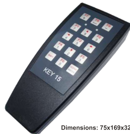
Dimensions: 75x169x32 mm

Two AA batteries will provide a long service.