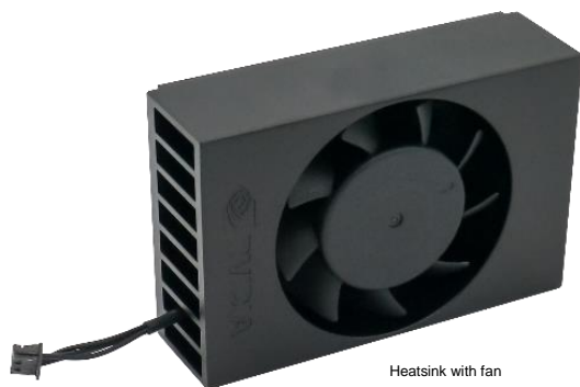
Heatsink with fan

RED: module envelope, keep out zone for component clearance BLUE: Processor die GREEN: PCB + underside The envelope for thermal solution 3D model is available in the Nvidia developer download area