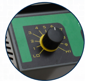
10 Heat Settings Temperature Range: 200-450 C