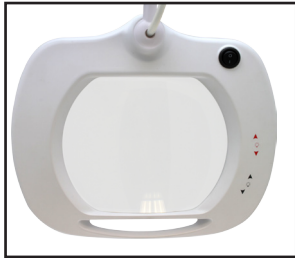
7.5 Inch x 6.2 inch/ 3 Diopter Lens 1.75x Magnification