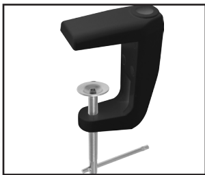
Heavy-Duty Mounting Clamp