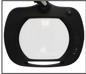
7.5 Inch x 6.2 inch/ 5 Diopter Lens 2.25x Magnification