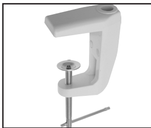
Heavy-Duty Mounting Clamp