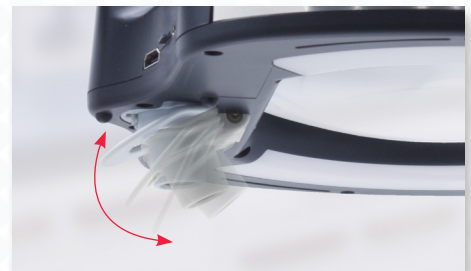
Tilt the Camera to Adjust the Image On Screen to Your Desired Angle