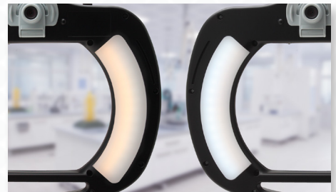
Frosted Diffuser w/ Color Temperature Controls