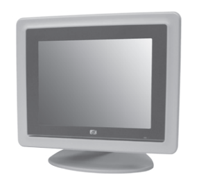
▲ Deskton stand