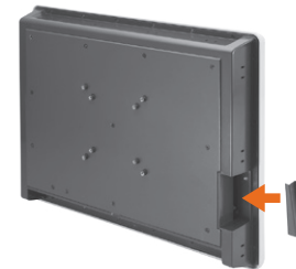
▲ CompactFlash™ slot with protective cover