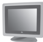
▲ Desktop stand