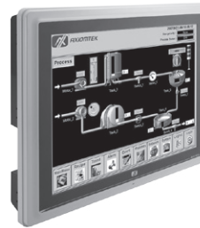
▲ Side view