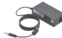
▲ AC power adapter (GOT5152T-832-J)